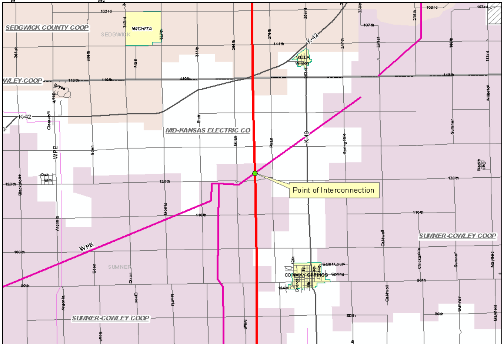
Figure 2 – Westar Energy Local Area Transmission

The proposed project is not within the Westar Energy service area.